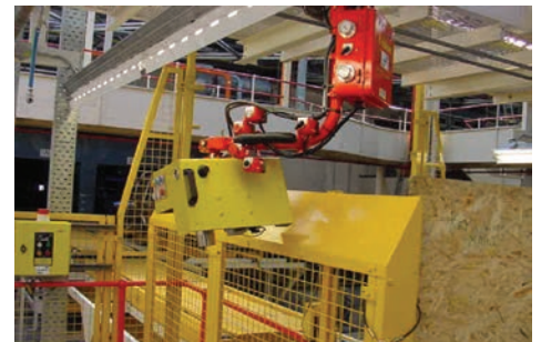
Professional Custom Designed Systems