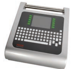
3000 series controller

Our scribe range control units provides many interfacing options and modes of operation. The controllers' 24v digital input/output port features 8 inputs and 6 outputs. These can be programmed using a simple scripting language for custom machine control. The 2 x RS232 serial ports may also be configured for downloading marking data and controlling the marking system. In addition, an optional TCP/IP Ethernet port allows multiple systems to be controlled from a central server.