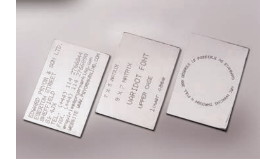
Marks Using BenchDot™ with 3000 Controller