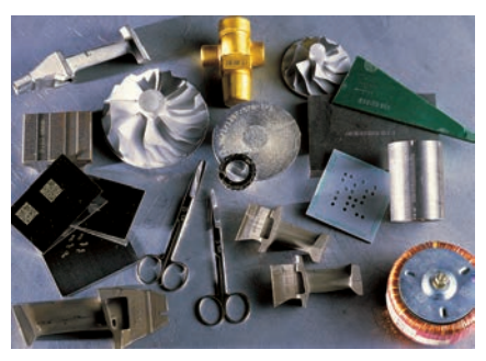
BenchDot™ systems are extremely versatile with the ability to mark almost any shape part