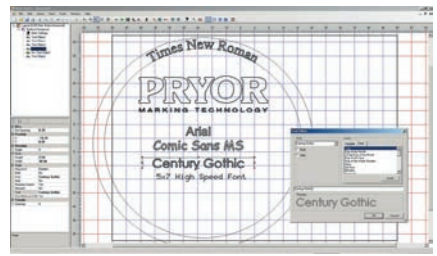
User interface in Traceable-IT™ (Advanced) software