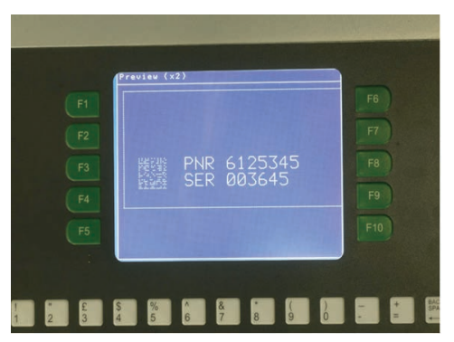
3000 series controller